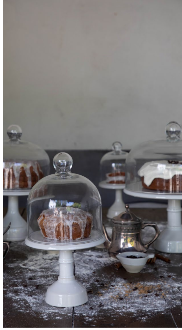
Glass Domes are great for more than cake. Pies, cheese and fruit will also look delectable and delightful under these clear domes.